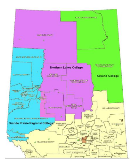
Diagram 1 – Catchment Areas of Keyano College, Northern Lakes College, and Grande Prairie Regional College

Representatives from the communities within each college district are being invited to meet with the project team in May 2011 and discuss their thoughts on continuing care at an informal networking event.