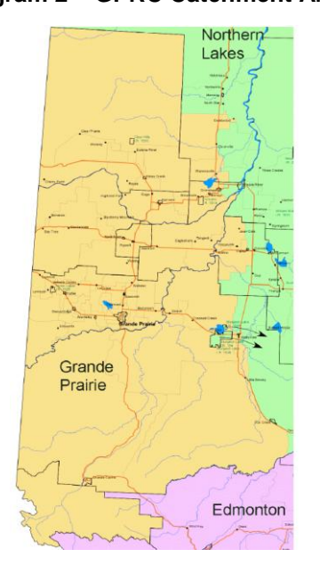
Diagram 2 - GPRC Catchment Area

The catchment area for Grande Prairie Regional College includes: the County of Grande Prairie (including the City of Grande Prairie. Horse Lakes 128B Indian Reserve. Beaverlodge, Sexsmith, Wembley, Hythe, Bezanson, Clairmont, Demmitt, Dimsdale, Elmworth, Goodfare, Huallen, Teepee Creek, Valhalla Centre, Wedgewood, and others); the town and MD of Spirit River; the County of Birch Hills; MD of Northern Lights 22; MD and town of Fairview; County of Saddle Hills; MD of Clear Hills; ID 25 (Wildmore Wilderness); part of MD Peace River (minus the town of Peace River); part of MD Smoky River 130; and most of MD Greenview.